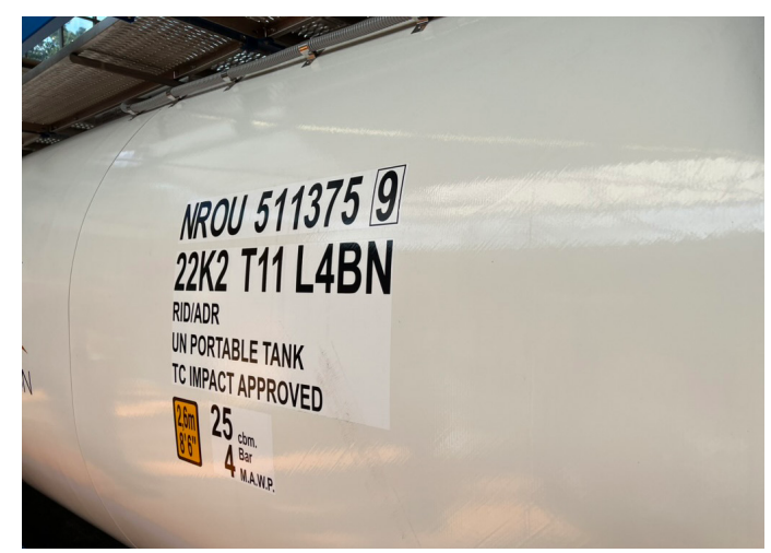
Dual specification markings (RID/ADR L4BN - UN Portable T11)